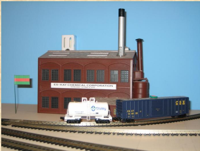
This is a photo of the Es-Kay Chemical Corporation in Kernville. The building was formerly located near Mentor, OH. It is not known how the building was relocated to the new site. The building was kitbashed from two Heljan kits.